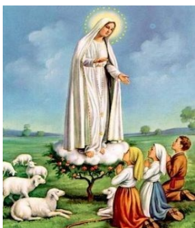
1917 FATIMA 2017