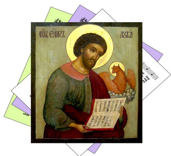
Year C The Year of St Luke